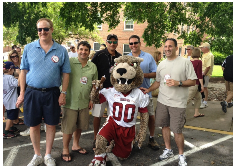
Brothers from the Class of 1987 pose with the Lafayette Leopard.

We look forward to more Dekes reliving their undergraduate experience like these six did!